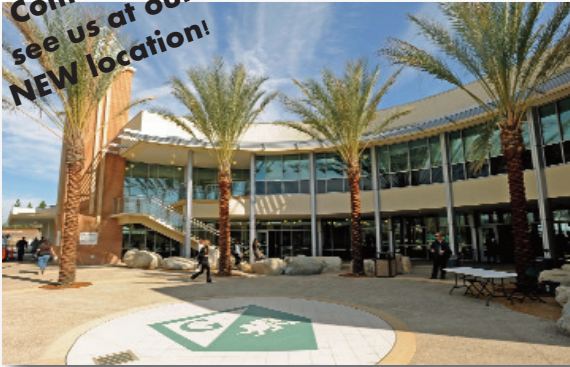
Building 60, Rooms 140, 145, 146